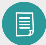
How to Develop a Portfolio Career in Academia