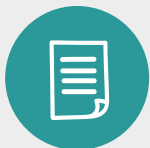
Should I do a PhD?